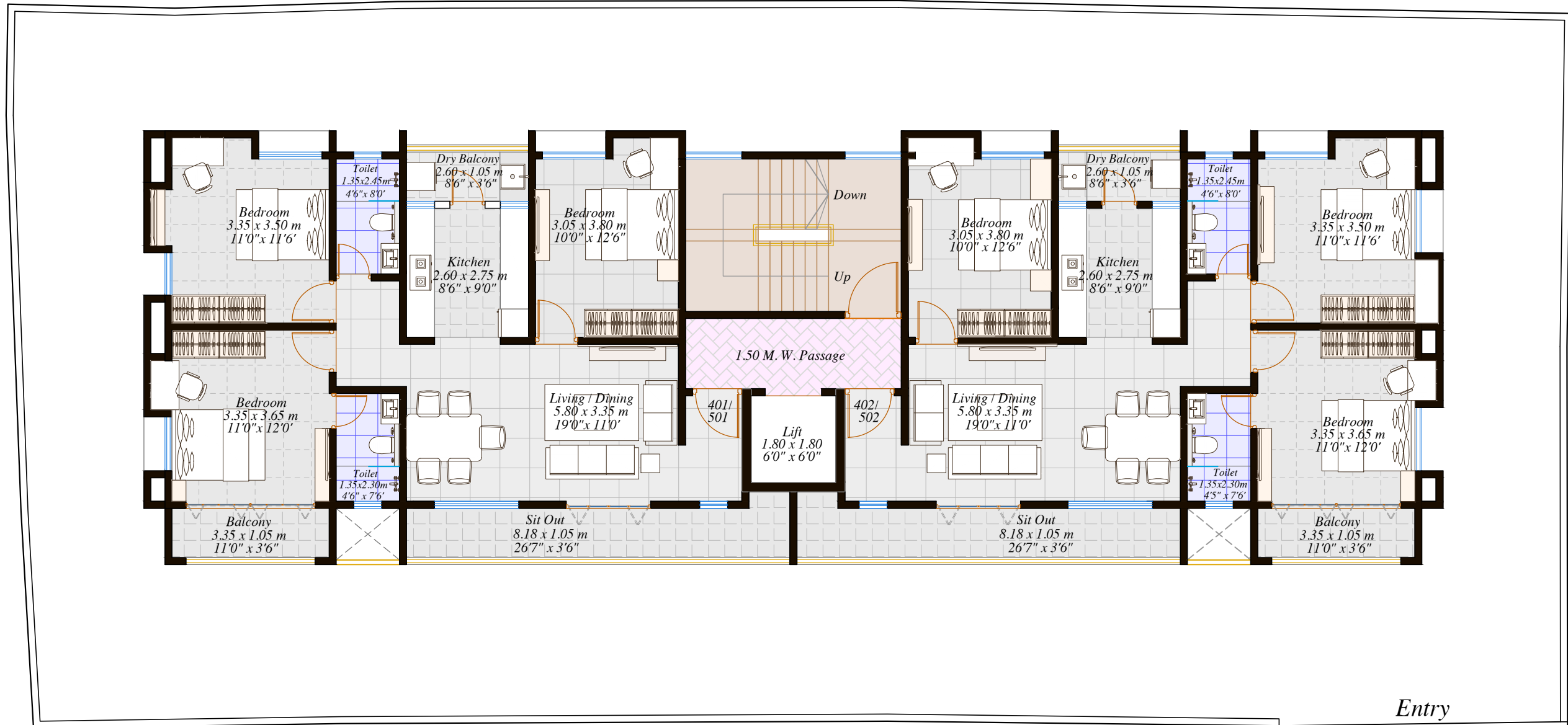
TYPICAL 4TH AND 5TH FLOOR PLAN